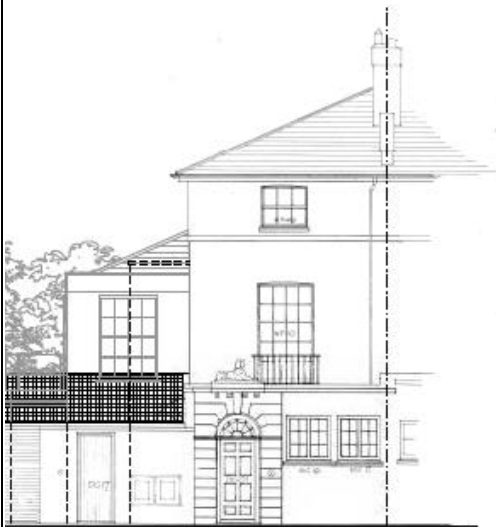
Existing South East Elevation